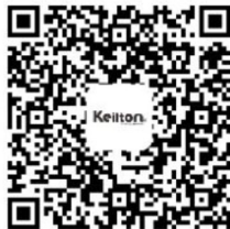
Keilton Android @GooglePlay